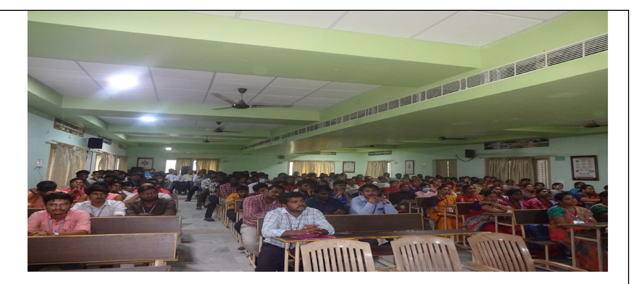
Faculty and students participated in the program